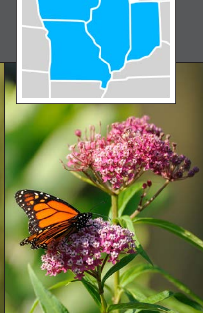
Showy goldenrod, field thistle, and swamp milkweed

In the Midwestern states of Iowa, Missouri, Illinois, and Indiana, a wealth of plant diversity grows in lush tallgrass prairies, as well as in oak savannas, windswept lakeshore dunes, shallow soils and rocky slopes of glades, and within deciduous forests.