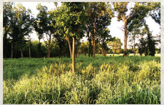
Sandy Hollow oak savanna restoration at dawn.

Oak woodlands need our help. These critical habitats are in trouble across the eastern United States. One factor is that oaks are not regenerating in overly shaded areas. Sub-canopy and ground layer species are also impacted by a lack of sunlight. By opening the canopy in some areas, we can encourage young oaks to grow beyond the seedling stage and improve habitat for native plants and the wildlife they support.