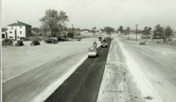
PRESERVING LAKE COUNTY'S NATURAL AND CULTURAL HISTORY Above, from left: Native Americans navigated a regional network of trails using trail marker trees such as this one, photographed west of Fort Sheridan circa 1930; this 1913 photo of a northern flatwoods community located near Highland Park provides a glimpse at the character of Lake County natural areas before they were impacted by European settlement, altered hydrology and introduction of invasive species; rich soil and abundant fresh water made agriculture a key industry in the county from the 1830s-1950s (Prairie View, 1909); county roads began to be paved in the 1910s to accommodate automobile traffic, such as along Sheridan Road near Lyons Woods, circa 1935. Below, from left: Spring woodland wildflowers at Edward L. Ryerson Conservation Area, Riverwoods; sunset on Lake Michigan at Fort Sheridan Forest Preserve, Lake Forest; mature oak tree near a trail at Nippersink Forest Preserve, Round Lake.