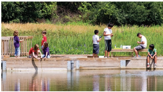
Fishing at Nippersink Forest Preserve in Round Lake.

As Lake County’s principal guardian of open space and natural areas since 1958, we protect and manage nearly 31,000 acres of land for conservation, passive recreation, and nature and history education. We are the second largest Forest Preserve District in Illinois.