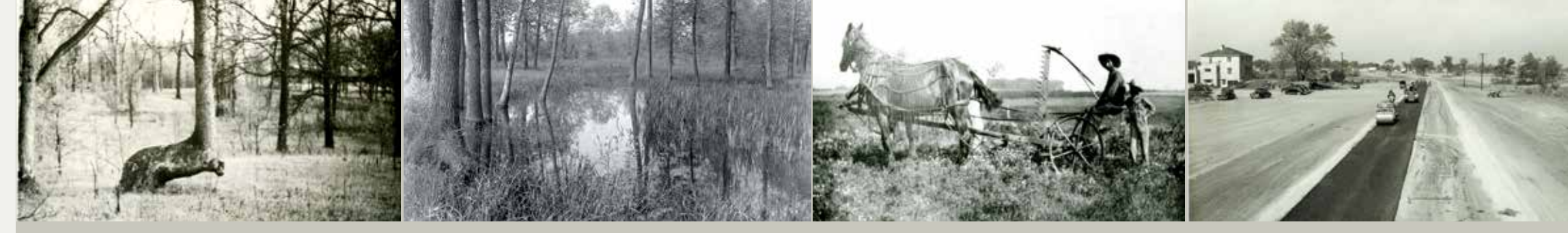
PRESERVING LAKE COUNTY'S NATURAL AND CULTURAL HISTORY Above, from left: Native Americans navigated a regional network of trails using trail marker trees such as this one, photographed west of Fort Sheridan circa 1930; this 1913 photo of a northern flatwoods community located near Highland Park provides a glimpse at the character of Lake County natural areas before they were impacted by European settlement, altered hydrology and introduction of invasive species; rich soil and abundant fresh water made agriculture a key industry in the county from the 1830s-1950s (Prairie View, 1909); county roads began to be paved in the 1910s to accommodate automobile traffic, such as along Sheridan Road near Lyons Woods, circa 1935. Below, from left: Spring woodland wildflowers at Edward L. Ryerson Conservation Area, Riverwoods; sunset on Lake Michigan at Fort Sheridan Forest Preserve, Lake Forest; mature oak tree near a trail at Nippersink Forest Preserve, Round Lake.