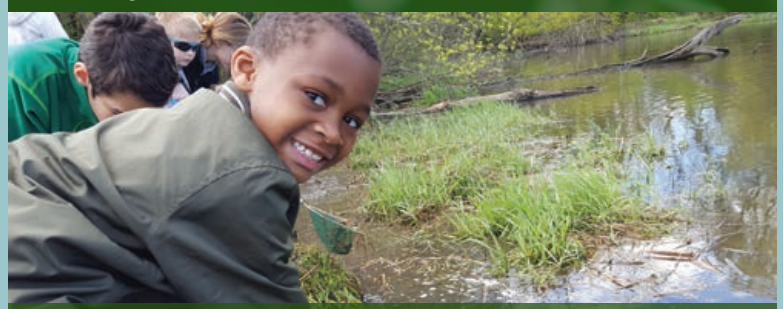
The Forest Preserves are living laboratories for our Science Explorers in Nature.