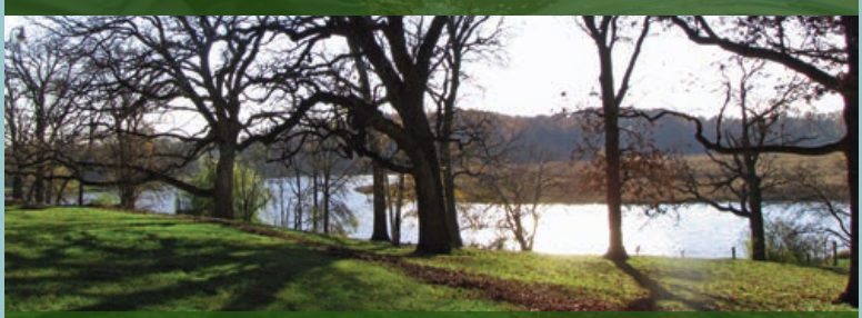
The 371-acre Cuneo property is an important addition to the wetlands of the larger Lakewood complex, which includes Broberg Marsh, the McLean Habitat Restoration area, and others.