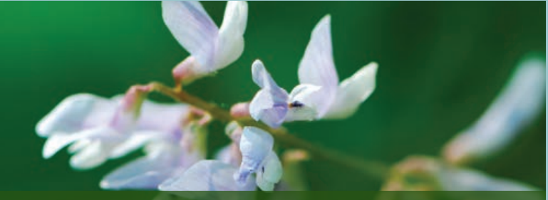
Grant Woods is the only known location in Lake County of the very rare Carolina vetch. It continues to thrive there thanks to habitat restoration and management.